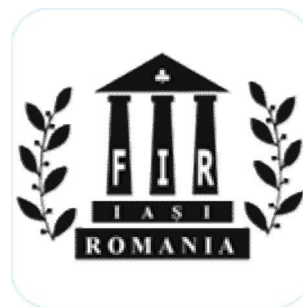
Romanian Inventors Forum