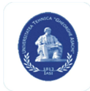
Gheorghe Asachi Technical University of Iasi