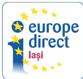
Europe Direct Iasi